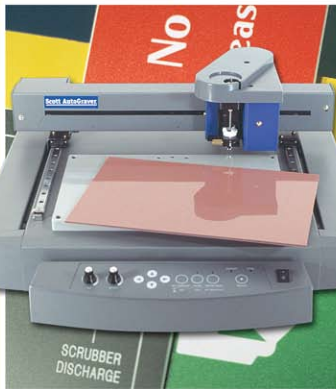
Scott AutoGraver® Engraving Machine